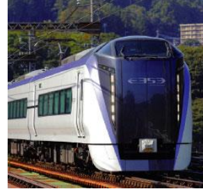
New Shikishima Limited Express