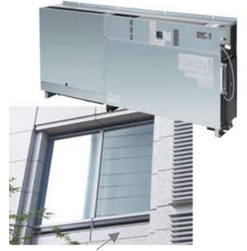
Port for outside air and exhaust air